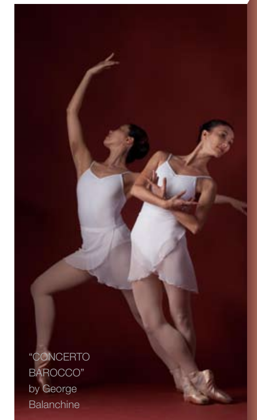
"CONCERTO BAROCO" by George Balanchine

Season Of Brilliance is a co-presentation by Singapore Dance Theatre and NUS Centre for the Arts. Performances are on 4 and 5 September, at the University Cultural Centre Hall. Tickets at $50, $40 and $30 (Student/NSmen/Senior Citizen tickets at $25) are available from Sistic on +65 6348 5555 or www.sistic.com.sg . For more information on the Singapore Dance Theatre, please visit www.singaporedancetheatre.com